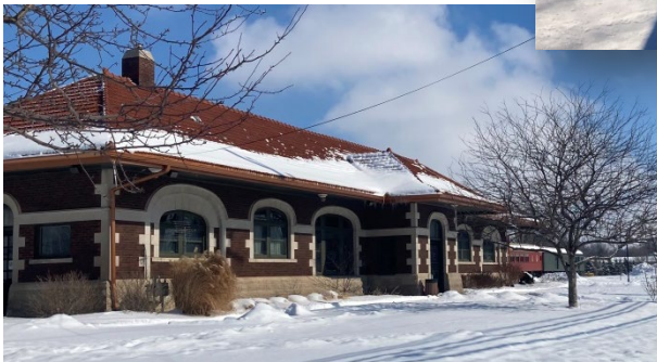
St. Johns Depot